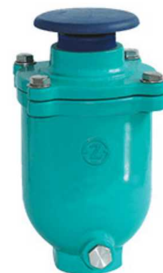
Series ZFCARX Automatic Air Vents

Made of Ductile Iron GGG50. On-off Application. PN 10/16/CL150 from DN 40 to DN 600. Face To Face Length EN558/API 609.