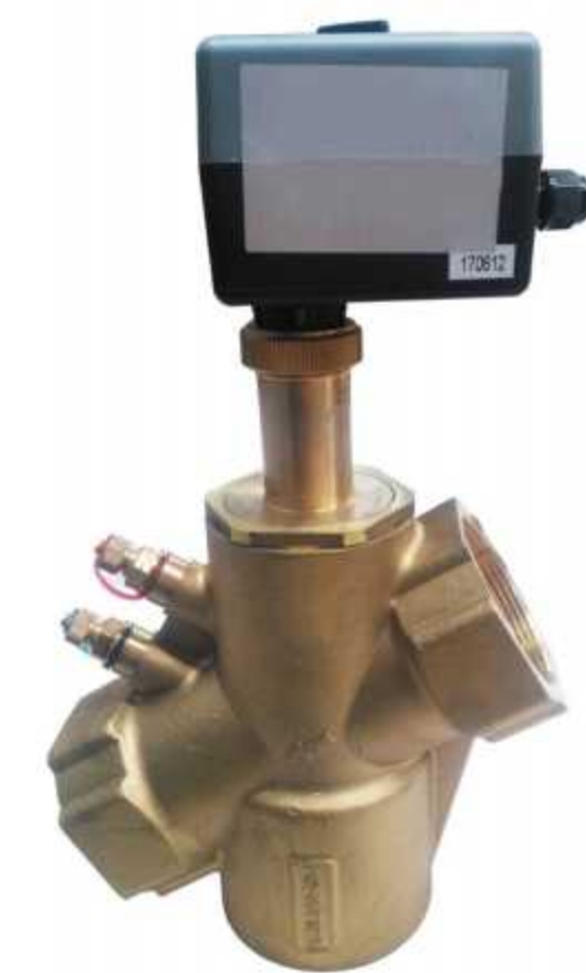
Series ZFLW-PICV Pressure Independent Control Valves

Made of Cast Brass. Adjustable, Isolation & Pressure Verification. PN 10/16/25 from DN 15 to DN 50. Thread Ends To BSP/NPT.