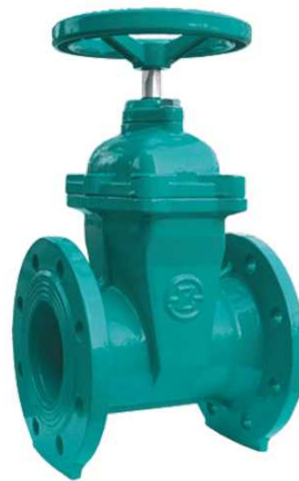
Series ZFZ45X Resilient Seat Gate Valves

Made of Ductile Iron GGG50. Lug Ends. PN 10/16/CL150 from DN 40 to DN 600. Face To Face Length EN558/API 609.