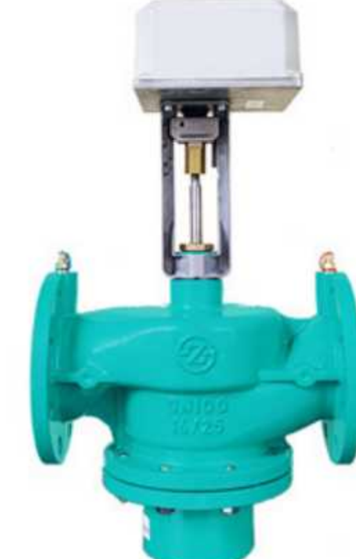
Series MDPF-PICV Pressure Independent Control Valves

Made of Ductile Iron GGG50. Variable Orifice. PN 10/16/25 from DN 50 to DN 400. Flanged Ends DIN PN 10/16/25.