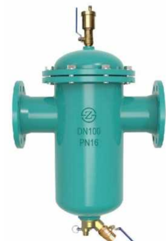
Series ZFSSC/M Spiral Decontamination Air and Dirt Separator

Made of Cast Brass & Cast Iron. 3-in-1 Function design. PN 10/16/25 from DN 10 to DN 50. Thread Ends To BSP/NPT.