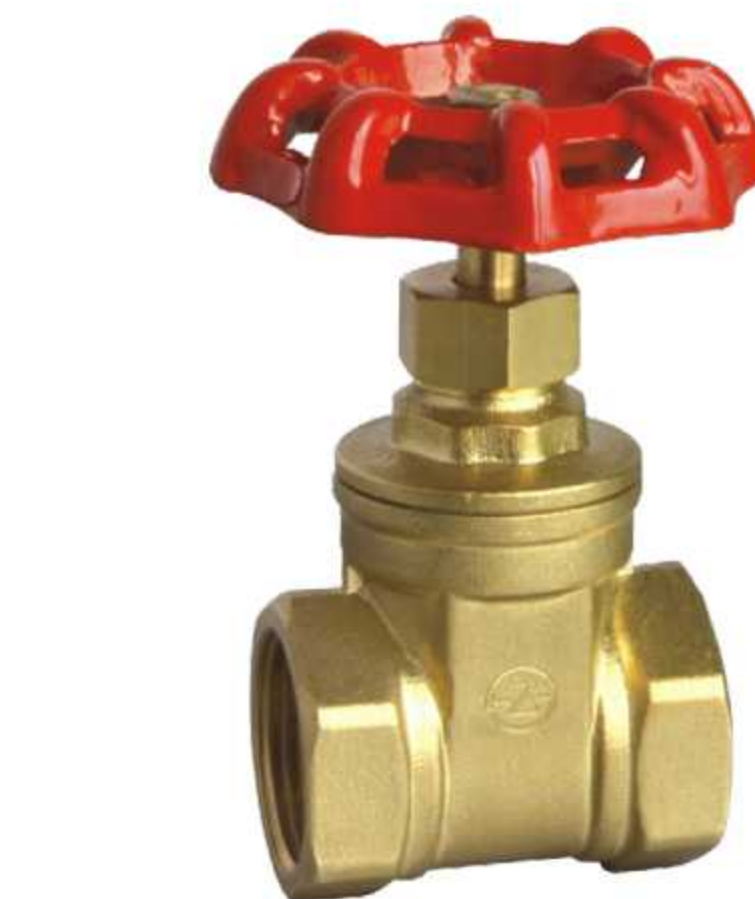
Series ZFZ15W Thread Ends Gate Valves

Made of Ductile Iron GGG50. Triple Functional. PN 10/16/25 from DN 50 to DN 400. Flanged Ends DIN PN 10/16/25.