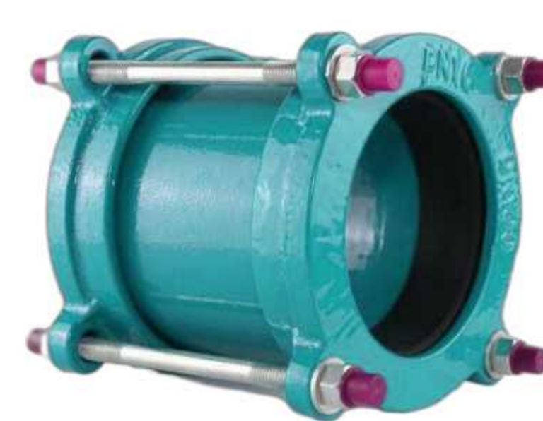
Series ZFTXJT Universal Flexible Coupling

Made of Carbon/Stainless Steel. Single/Double Sphere. PN 10/16/25 from DN 32 to DN 1600. Flanged Ends DIN PN 10/16/25.