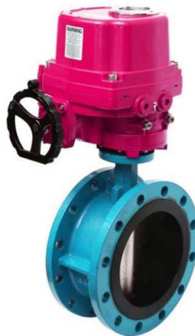
Series ZFD94/71X Motorised Butterfly Valves

Made of Ductile Iron GGG50. Flange Ends. PN 10/16/CL150 from DN 40 to DN 600. Face To Face Length EN558/API 609.