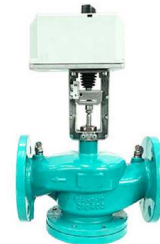
Series ZFVB4200 Two Way Motorised Valves

Made of Ductile Iron GGG50. Self-Operated. PN 10/16 from DN 40 to DN 200. Flanged Ends DIN PN 10/16.