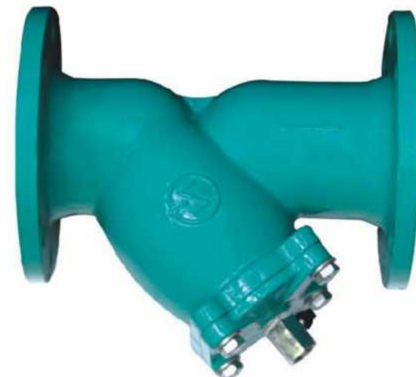
Series ZFY41P Flanged Ends Strainers

Made of Ductile Iron GGG50. 2-Way Wafer Ends. PN 10/16/25 from DN 65 to DN 350. Wafer Ends DIN PN 10/16/25.