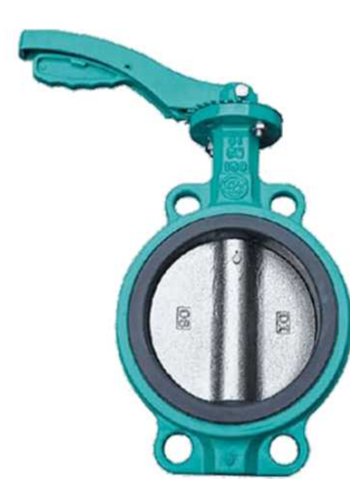
Series ZFD71X Center Lined Butterfly Valves

Made of Ductile Iron GGG50. Wafer Ends. PN 10/16/CL150 from DN 40 to DN 600. Face To Face Length EN558/API 609.