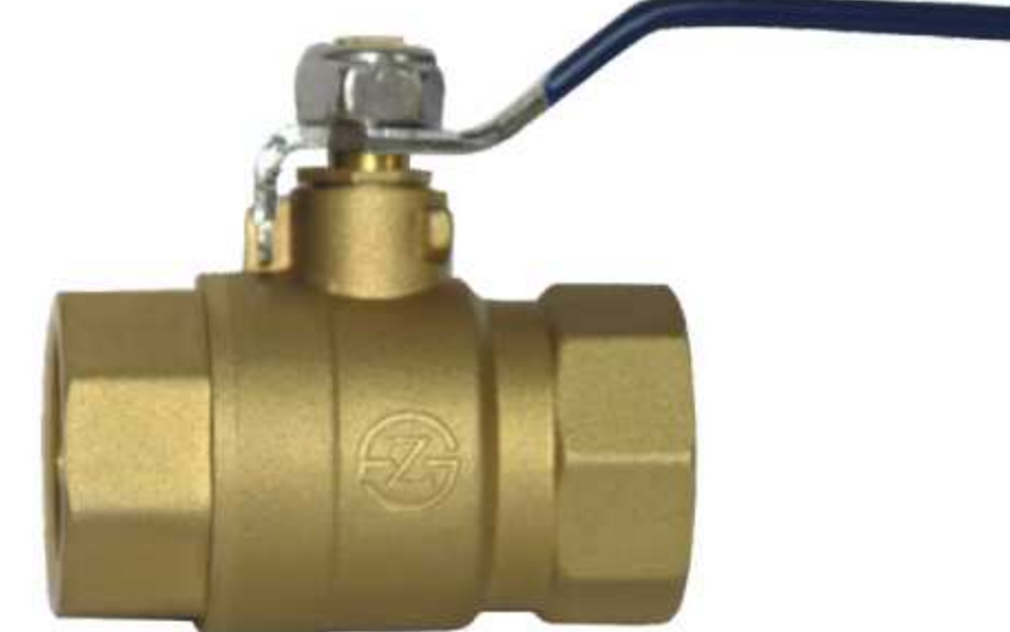
Series ZFQ11F Thread Ends Ball Valves

Made of Forged/Cast Brass/Bronze. Swing Type Disc. PN 10/16 from DN 15 to DN 50. Thread Ends To BSP.