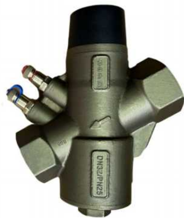
Series ZECO-DPCV Differential Pressure Control Valves

Made of Cast Brass. Fixed Orifice. PN 10/16 from DN 15 to DN 50. Thread Ends To BSP/NPT.