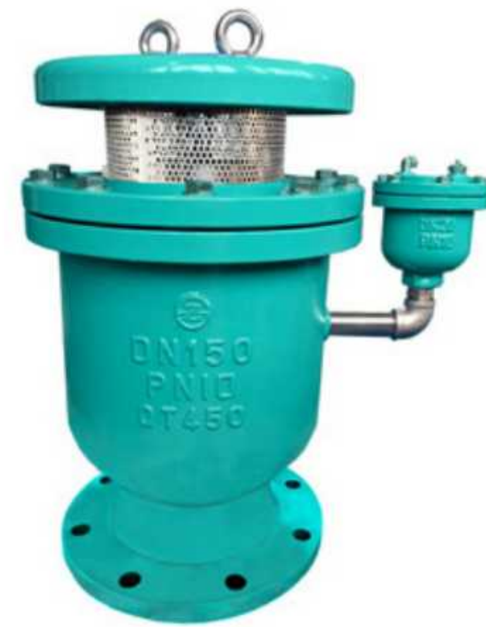
Series ZFFGP4X Combination Air Valves

Made of Ductile Iron GGG50. Single Orifice. PN 16 from DN 15 to DN 50. Thread Ends To BSP.