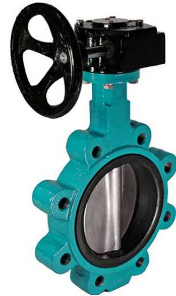
Series ZFLT71X Center Lined Butterfly Valves

Made of Ductile Iron GGG50. Wafer Ends. PN 10/16/CL150 from DN 40 to DN 600. Face To Face Length EN558/API 609.