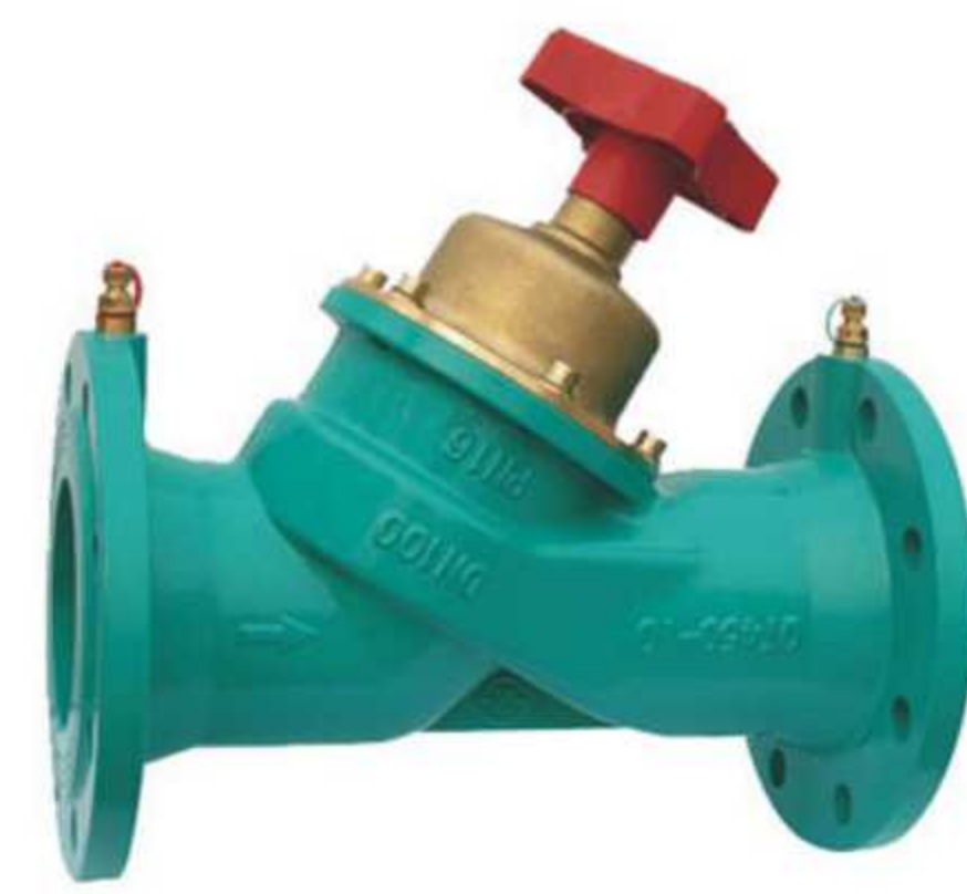
Series SZF/F Static Balancing Valves (VODRV)

In 2008, With the support of the Jiangsu Binhai local government, We set the valve production base and R&D center in Binhai pump and valve industrial park through nearly a year's hard construction. in the following year, ZECO valve group was formally established. Today, We have a modern workshop, more equipped with hundreds of sets of modern equipment, has a professional design team and management team, and hundreds of outstanding employees with strong professional dedication, the group has been promoted to a new level in design, production, and manufacturing of valves.