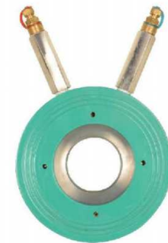
Series ZFFOTH Fixed Orifice Measurement Devices

Made of Ductile Iron GGG50. Soft Seat. PN 10/16 from DN 50 to DN 500. Flanged Ends DIN PN 10/16.