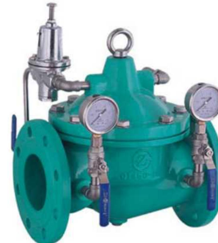
Series ZF200X Automatic Control Valves

Made of Ductile Iron GGG50. ON-OFF Application. PN 10/16 from DN 50 to DN 200. Flanged Ends DIN PN 10/16.