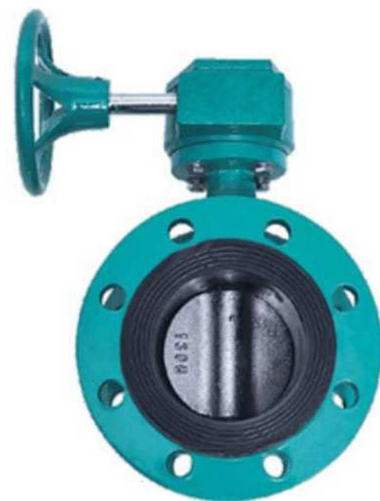
Series ZFD41X Center Lined Butterfly Valves

Made of Ductile Iron GGG50. Rising Stem. PN 10/16/25 from DN 40 to DN 1000. Flanged Ends DIN PN 10/16/25.