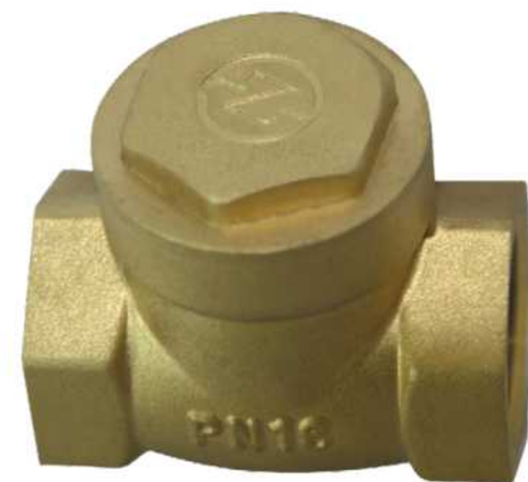
Series ZFH14W Thread Ends Check Valves

Made of Forged/Cast Brass/Bronze. Screw in Bonnet. PN 10/16 from DN 15 to DN 50. Thread Ends To BSP.