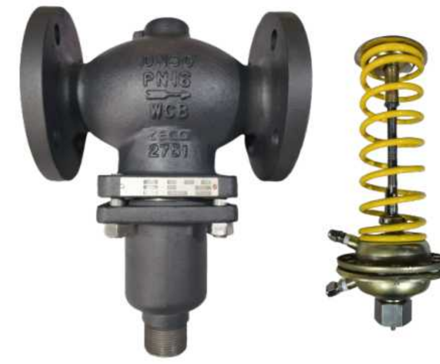
Series ZZY Self-Operated Pressure Regulator

Made of Ductile Iron GGG50. Pressure Reducing Application. PN 10/16 from DN 50 to DN 500. Flanged Ends DIN PN 10/16.