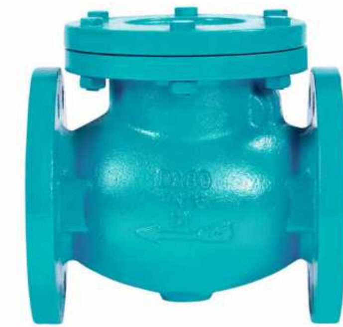
Series ZFH44T Swing Disc Check Valves

Made of Ductile Iron GGG50. Y Pattern. PN 10/16/25 from DN 50 to DN 500. Flanged Ends DIN PN 10/16/25.