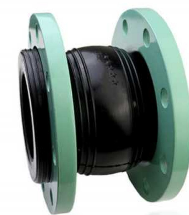
Series ZFKXT Expansion Rubber Joint

Made of Stainless Steel and Copper Alloy. For Flow Measurement With Or Without Isolation Facility. PN 10/16 from DN 50 to DN 800.