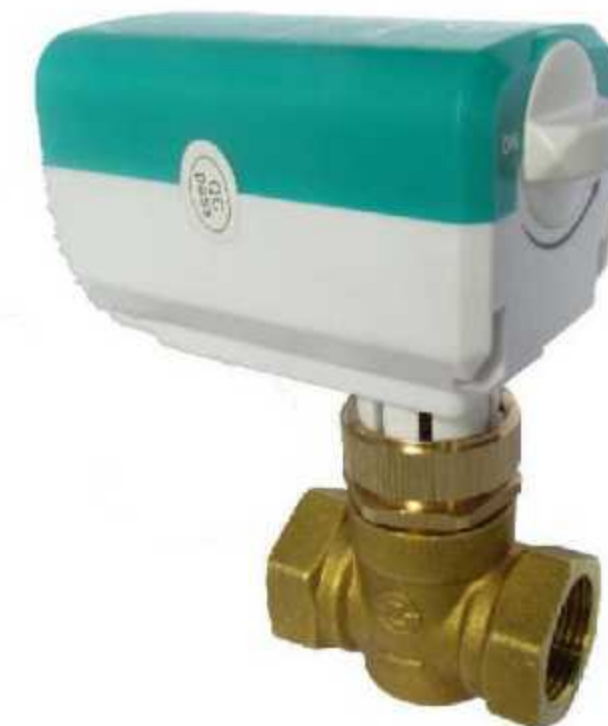
Series ZFVB1100 Two Way Motorised Valves

Made of Carbon Steel. Automation & High Accuracy. PN 10/16 from DN 50 to DN 300. Flanged Ends DIN PN 10/16.