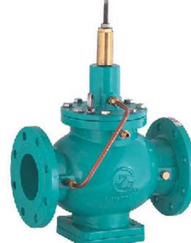
Series ZFKYF Differential Pressure Control Valves

Made of Ductile Iron GGG50. Equal Percentage Flow. PN 10/16 from DN 50 to DN 200. Flanged Ends DIN PN 10/16.