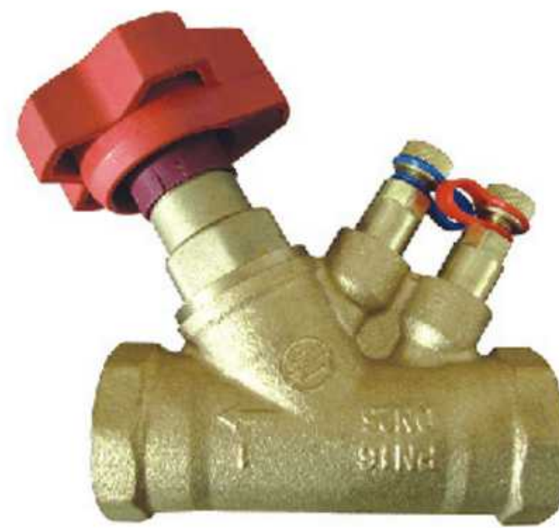
Series SZF/D Static Balancing Valves (FODRV)

Made of Forged/Cast Brass/Bronze. Full or Reduced Bore. PN 10/16 from DN 15 to DN 50. Thread Ends To BSP.