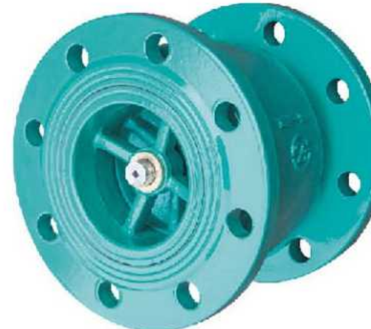
Series ZFH41X Silent Type Check Valves

Made of Ductile Iron GGG50. Metal Seat. PN 10/16/25 from DN 50 to DN 600. Flanged Ends DIN PN 10/16/25.