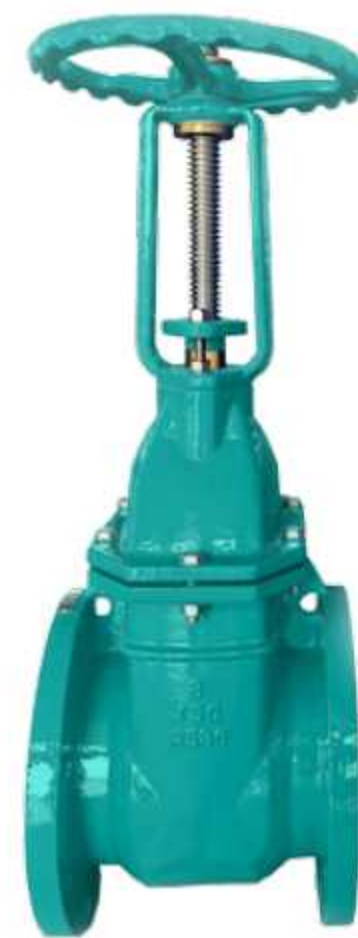
Series ZFZ41T Metal Seat Gate Valves

Made of Ductile Iron GGG50. Non Rising Stem. PN 10/16/25 from DN 40 to DN 1000. Flanged Ends DIN PN 10/16/25.